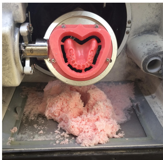
Milling Upper Base